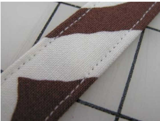
Stitch around both edges of the handle.