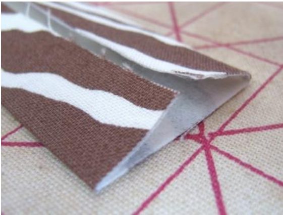
Open up the fold and press both edges toward it, as shown above.