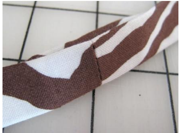
Refold the handle and press.