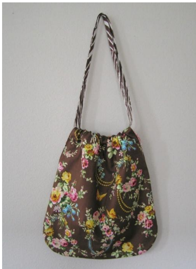
Shoulder Bag 13" high x 12" wide

With no pattern pieces, no metal hardware and very little interfacing, these bags come together quickly. A perfect showcase for your favorite Spring fabric!