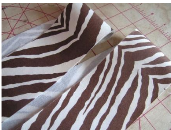
Fuse interfacing to the wrong side of handles.

Directions are the same for both styles.