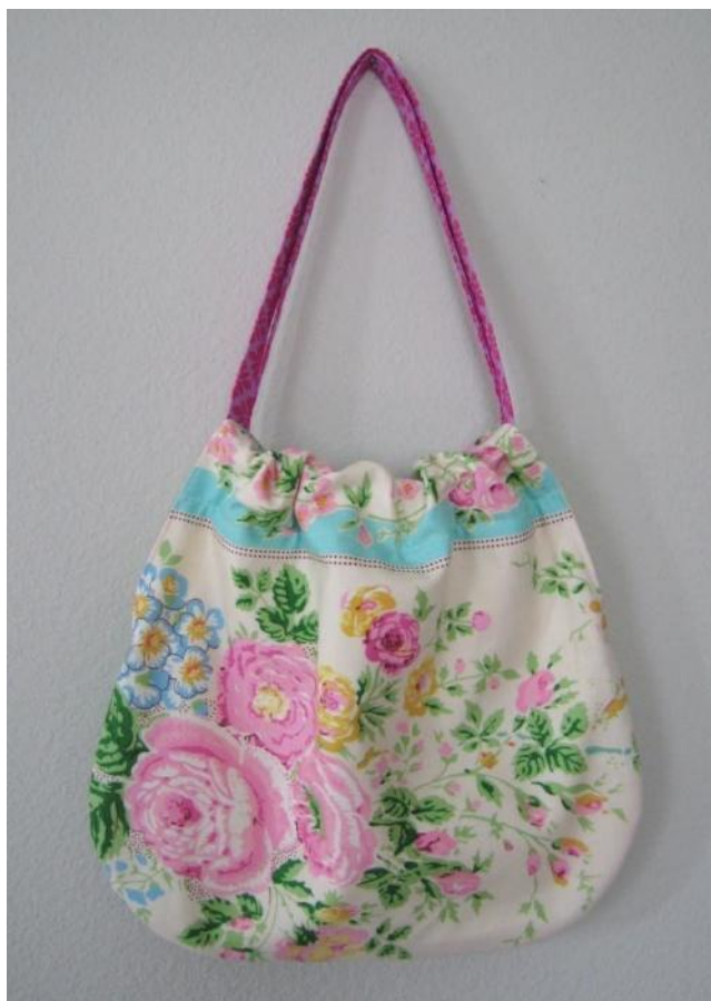
Handbag 10" high x 11" wide