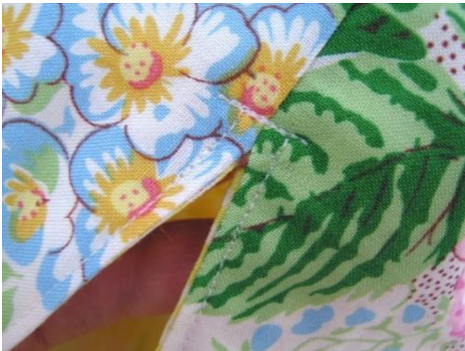
Stitch near the edge of the top vents, turning and stitching back and forth where they meet the bag's side seam, as shown above.