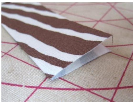
Press one handle in half, as shown above.