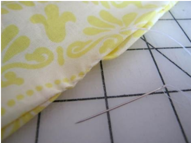
Hand or machine sew the opening closed.