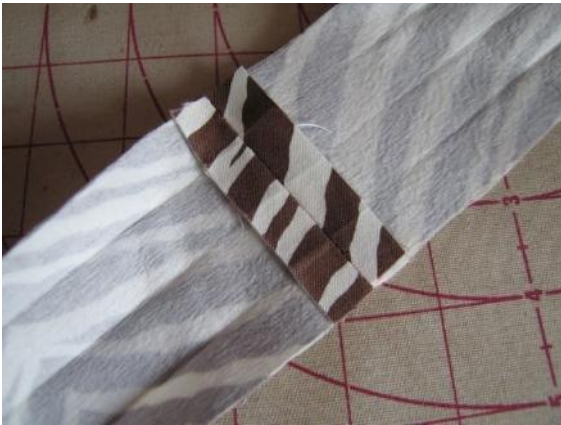
Open up the folds at both ends of handle, match, and sew together using a 1/2" seam allowance, creating a closed loop (make sure neither end gets twisted!).