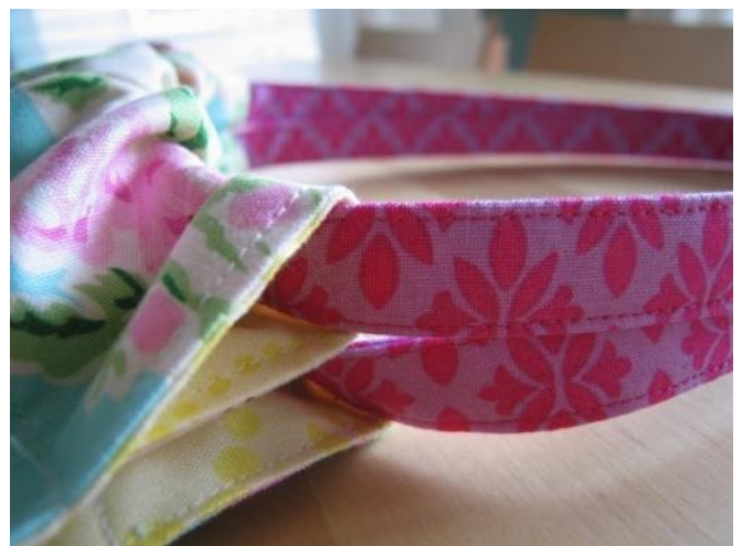
Pull handles to gather top of bag.