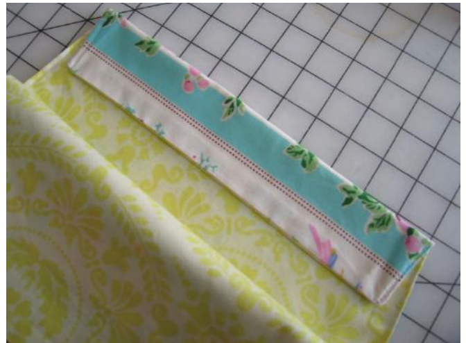
Create handle casing by folding 2" of the top of one side of the bag to the inside, as shown above.