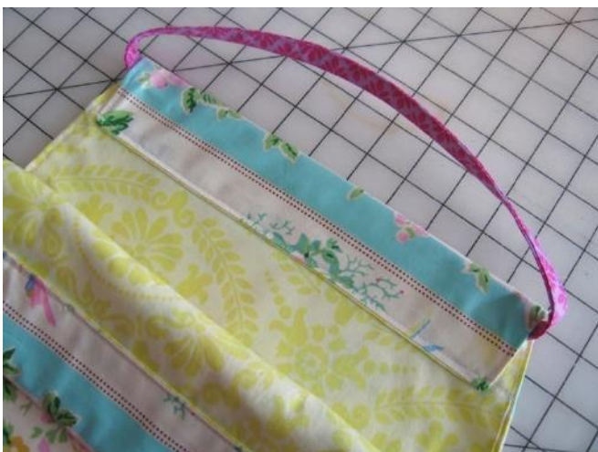
Slide handle under fold and pin in place. Keeping handle out of the way, sew across the top of the bag, close to the edge of the casing. Repeat with the other side.