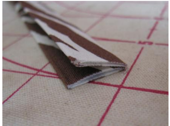
Again press the handle in half, as shown, leaving no raw edges except at both ends.