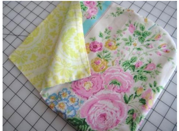
Your bag should now look something like this. Press.